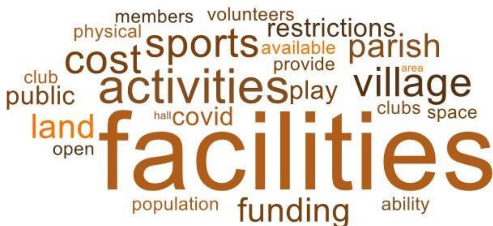
Figure 1: Word cloud showing the recurring challenges and opportunities from all survey responses (sports clubs, schools, voluntary groups, town/parish councils).

"Try to establish a 'collective thinking' with different groups and work together to ensure maximum provision for all residents across the district."