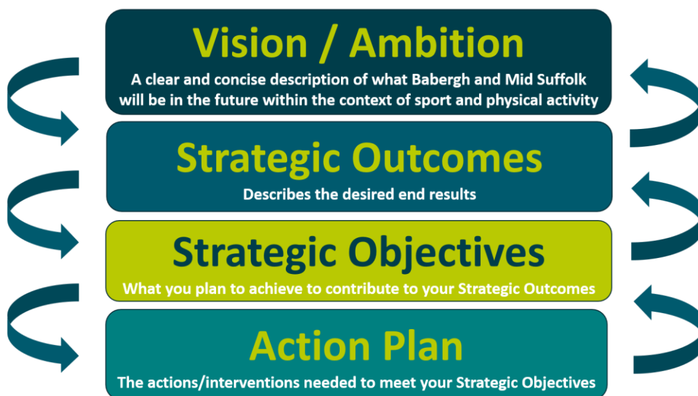
Figure 2: The Strategy Framework